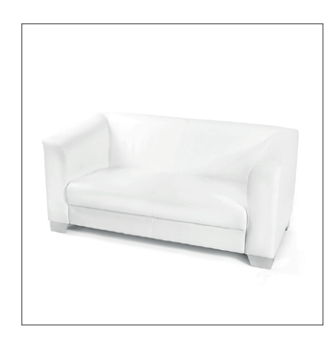
Item No. 202042 Leather sofa Virginia white 160 \times 80 \times 70 \text{ cm}