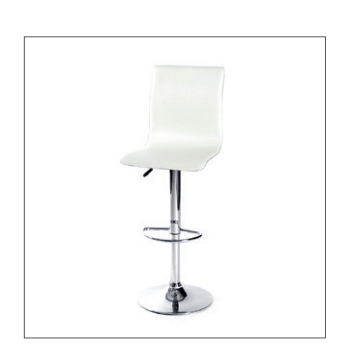
Item No. 530 Bar stool with backrest frame chrome, seat upholstery leather white 40 \times 45 \text{ cm (B} \times T) seat height: 58 - 80 cm