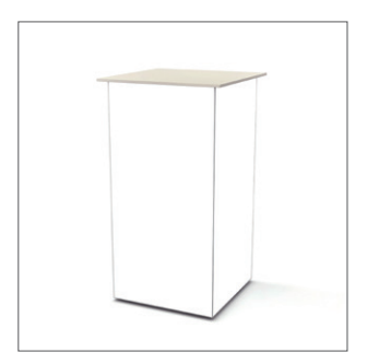
Item No. 487 Standing table Lumina individually printable, fabric covering, backlit 50 × 100 × 50 cm