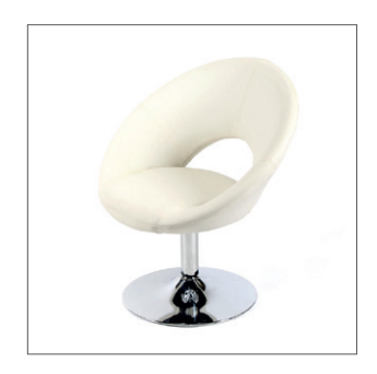
Item No. 202039 Club chair Metis rotatable, chrome-plated metal, leatherette, white 74 × 78 × 60 cm