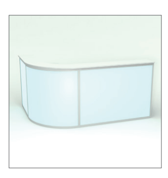
Item No. 489 Bar counter L-shape ((available only in Halle) lockable with attachment, backlit (color selectable) 215 × 125 × 145 cm