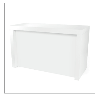
Item No. 201009 Standing table bridge 180, white, veneered 180 \times 110 \times 80 \text{ cm}