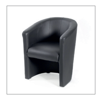
Item No. 490 Leather armchair Lounge black 65 × 77 × 60 cm seat height: 45 cm